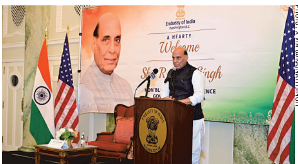
Interacting with the Indian diaspora in Washington, Defence Minister Rajnath Singh described India and US as natural allies

SOSA will enable both countries to acquire from one